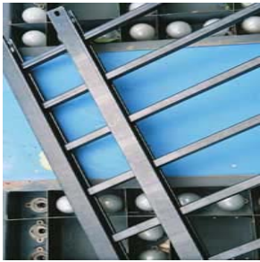
Michael Mills: The Object in Question Photography