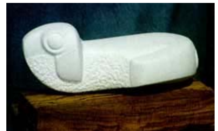
Sculpture by Lothar Nickel

Collector's Corner will have on display a private collection of antique pencil sharpeners.