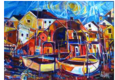
3RD PLACE—THELMA LUBELL Harbour