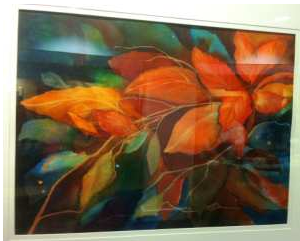
HONORABLE MENTION— SUSANNA CLEMM Autumn Leaves