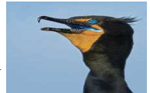
“Creativity in the Genes”