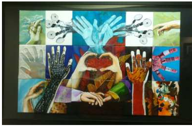
2ND PLACE—ISABEL PE'REZ Hands