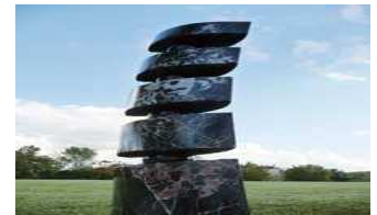
Nester Guzman Sculpture