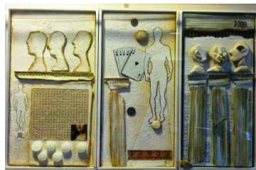
MERIT AWARD—GRACE FISHENFELD Three Dimension