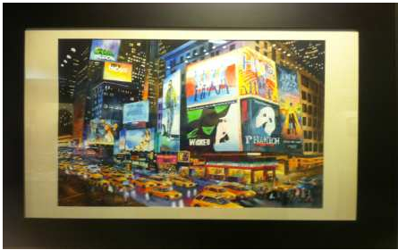
BEST IN SHOW—ROSARIO GIA Forty Seventh & Seventeenth