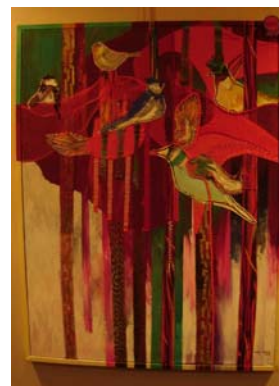
Honorable Mention Isabel Perez “The Tree of Birds”