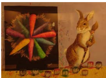
Honorable Mention Terry Molina “Old Buns Colorful Harvest”