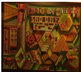
Honorable Mention Lee Goodman “Moving Day”