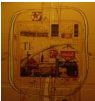
Third Place Winner Gus Sauter “Houston Street”