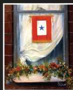
The Small Banner